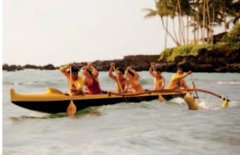
The Lembah Spa (left) at the Viceroy Ubud resort is but one of the many reasons Bali was named best island for luxury lodging worldwide. Guests paddle an outrigger canoe at Four Seasons Hualalai (right) on Hawaii's Big Island, which was picked as the best large luxury island resort in North America.