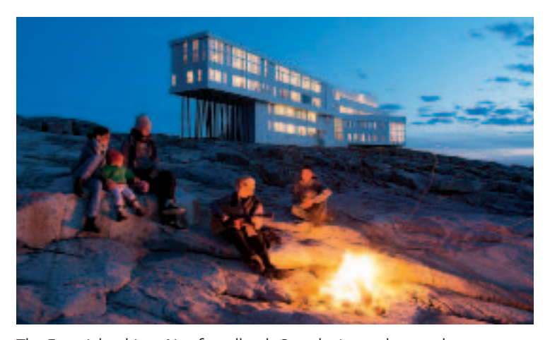
The Fogo Island Inn, Newfoundland, Canada, is an ultra-modern eco-resort with gourmet, locally sourced cuisine in a wilderness setting.

This small Caribbean island won big with experts. It's known for French flair, great food, upscale lodging and a sense of fashion and style missing in many other islands. Veteran luxury agent Litwak says, "Loaded with luxury hotels,